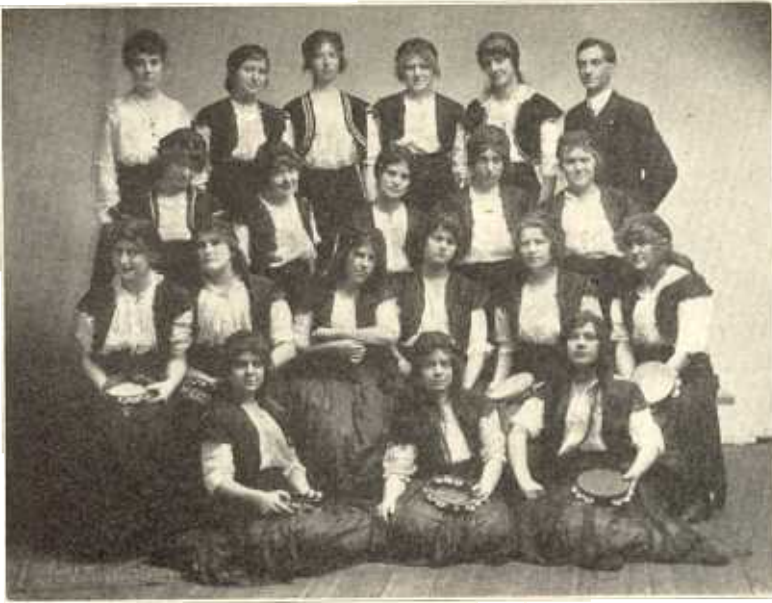
THE PHOENIX CLUB