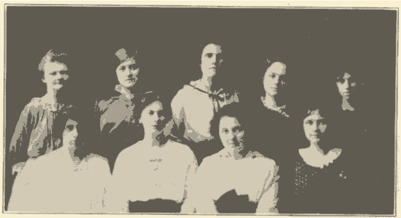
CABINET OF THE YOUNG WOMEN'S CHRISTIAN ASSOCIATION, 1915