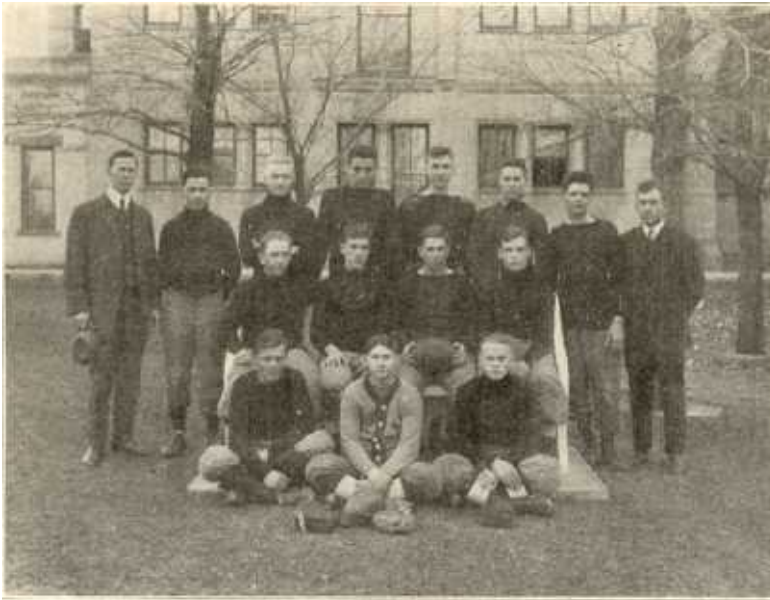
THE 1914 FOOT BALL TEAM